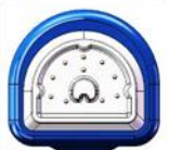
10 Pole Key 1 Plug Face