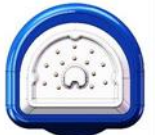
14 Pole Key 1 Plug Face