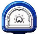
7 Pole Key 1 Plug Face