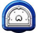
4 Pole Key 1 Plug Face