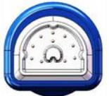
10 Pole Key 1 Plug Face